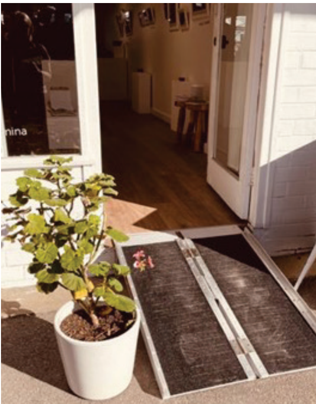
Image: A accessible ramp leads from a concrete path and through a door to an exhibition space.