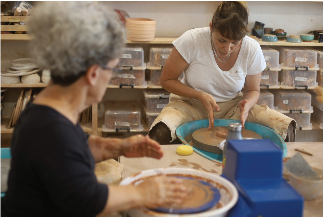
Image: A lady in a pottery studio standing at a modified pottery wheel receiving instruction from a pottery teacher.