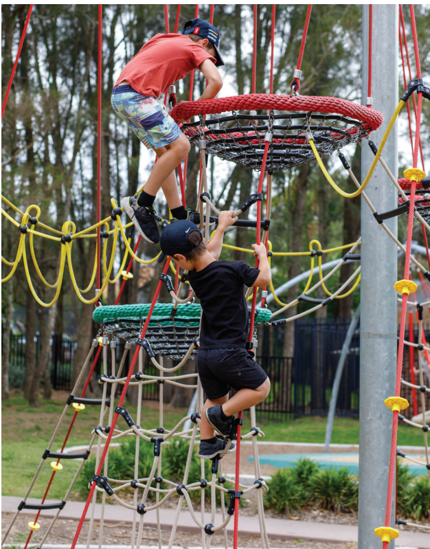
Image: Two boys climbing the ropes of suspended play equipment at Sun Valley Play Space.