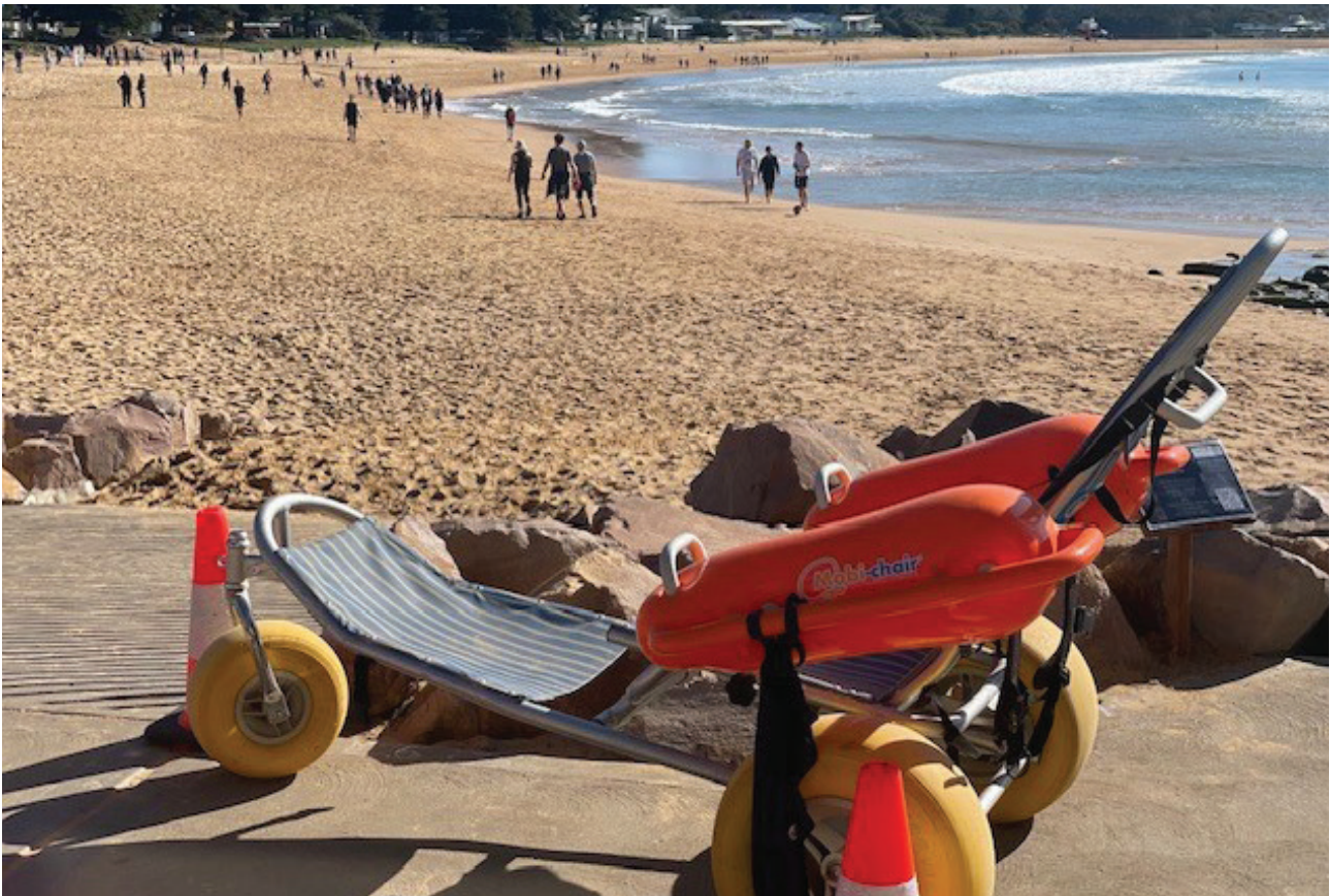
Image: A beach wheelchair sits on a cement pathway that accesses the sand of the beach. In the distance walkers are taking part in the 5 Lands Walk.