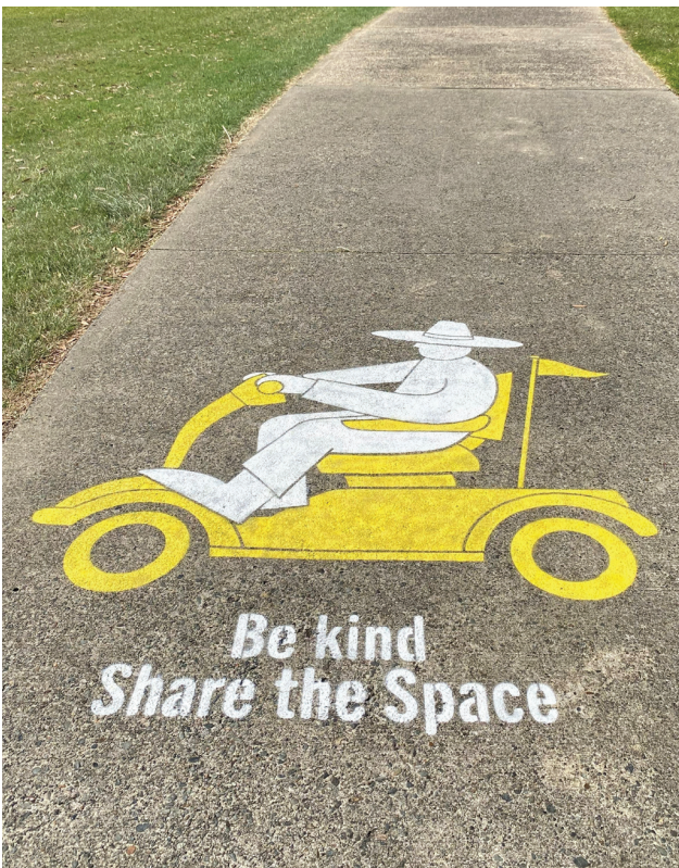
Image: A stenciled image on a cement pathway of an animated pathway user and banner that says, "Be kind. Share the Space."