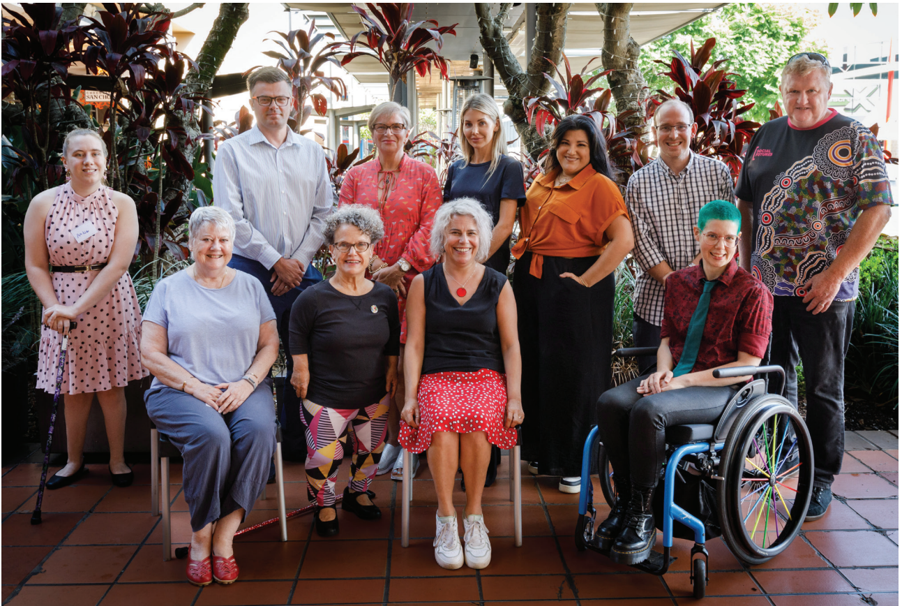
Image: A group photo of the 11 members of the Access and Inclusion Reference Group.