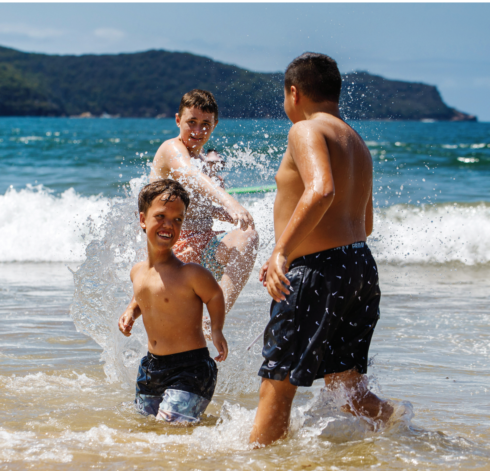
Image: Three boys splashing in the waves at Umina Beach.