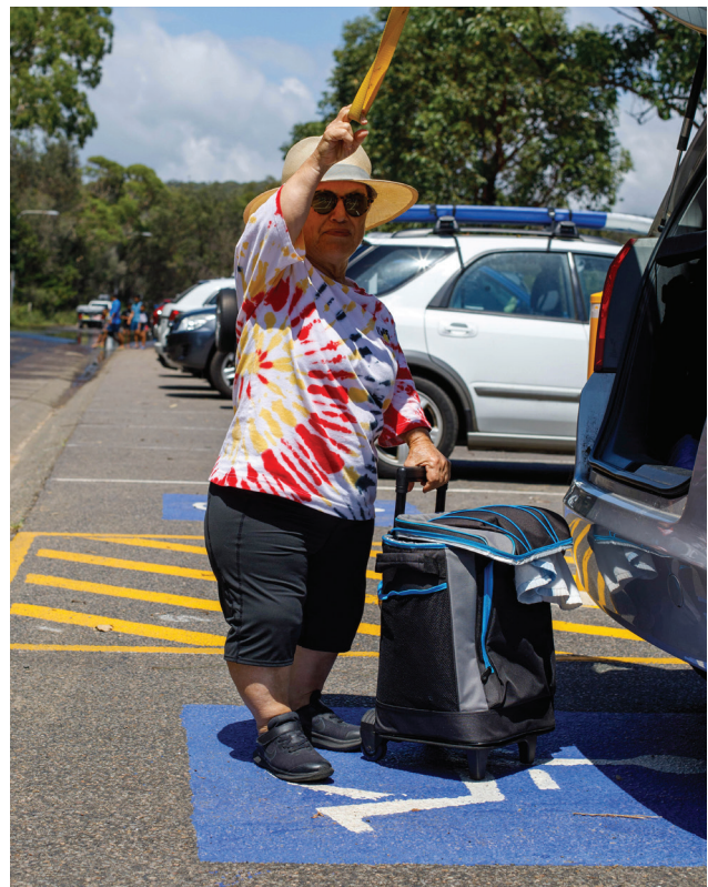
Image: A lady wearing a sun hat is unloading her car in an accessible parking space at Umina Beach.