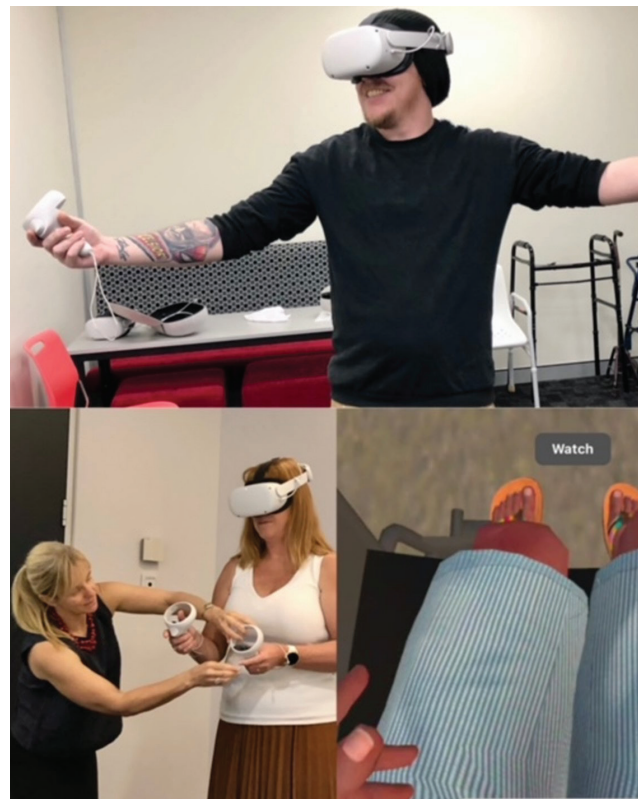
Image: Montage of the virtual reality project. People with VR headsets and hand controls, and the avatar viewed through the headset.