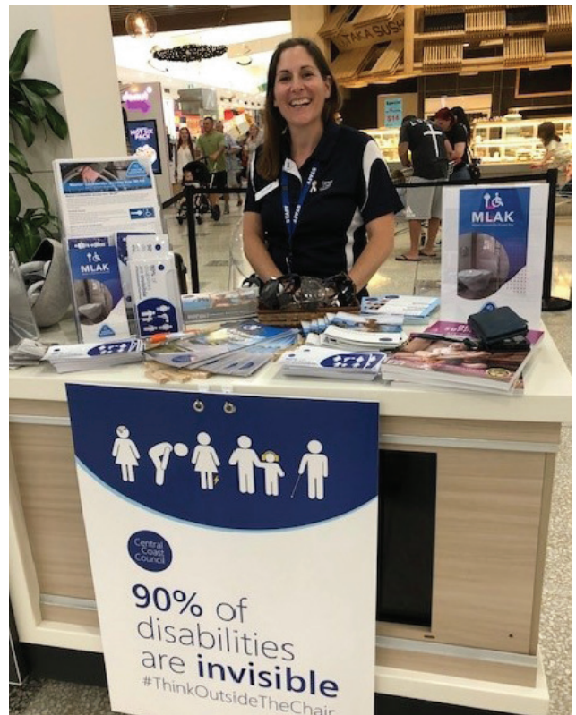
Image: A lady in Central Coast Council uniform stands behind a display with a sign about invisible disabilities.